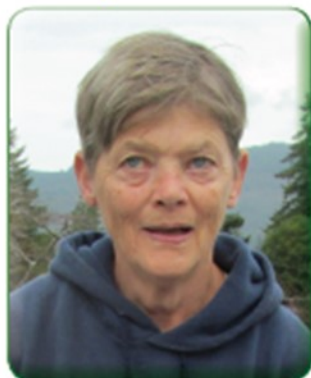
November 2019 Teresa Palmer