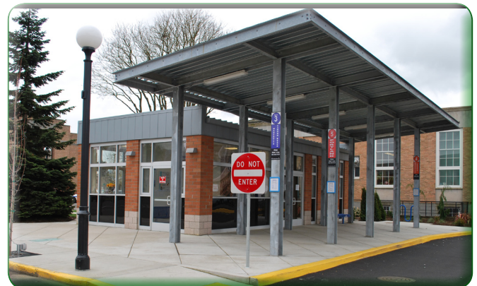
Transit Center Building

The Marie Mills Center Janitorial Program has 6 cleaning crews comprised of 16 workers with developmental disabilities. These crews currently service 36 janitorial contracts throughout Tillamook County. Our janitorial program has been in existence since 1980 and is one of the larger services on the North Oregon Coast, if not the largest. The Marie Mills Center Janitorial Crews are proud to announce that it recently received the contract for the new Tillamook County Transportation District Transit Center. In addition to keeping that brand new building clean, this provides an excellent opportunity for individuals with disabilities to have employment.