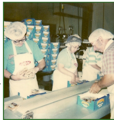
Packaging "Cookies" in the early '90s

viduals desiring a future for their children. Marie Mills Center started with a vocational program initially serving 9 individuals with disabilities and was manned by parents and volunteers. We are very grateful for these individuals pioneering efforts in 1969. Their initial efforts paved the way for today's services for those with disabilities in Tillamook County.