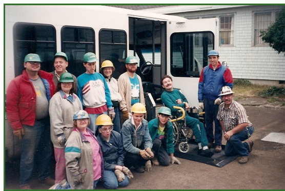
Cardboard Recycling Crew at original vocational facility in 1991.