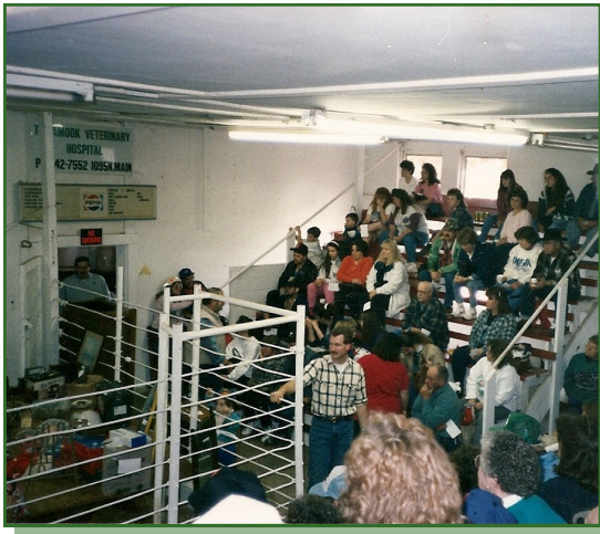
TARC Auction in mid '90s