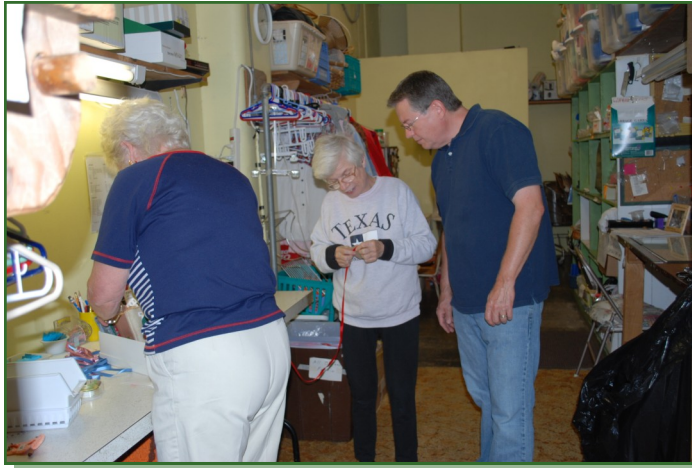
Learning "The Kits" Processes

TARC's Kit & Caboodle Thrift Store in Tillamook has been in operation since the 1970s and is fully manned by volunteers. When it came to our attention that "The Kit" was in need of help