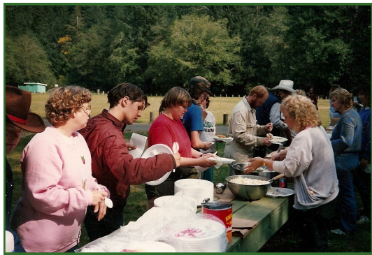
Picnic at Kilchis Park in mid '80s

local support the Marie Mills Center Vocational Program exited its long time