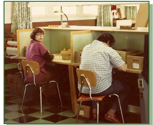
Assembly work at original vocational facility in late 1970s.

When reflecting on the past many years, much has happened because of the efforts of that initial grass roots effort in 1969 that cared enough to invest their time developing services for those with developmental disabilities.