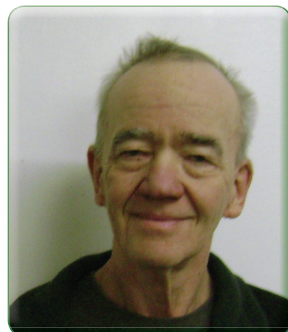
January 2011 Jack Buchanan