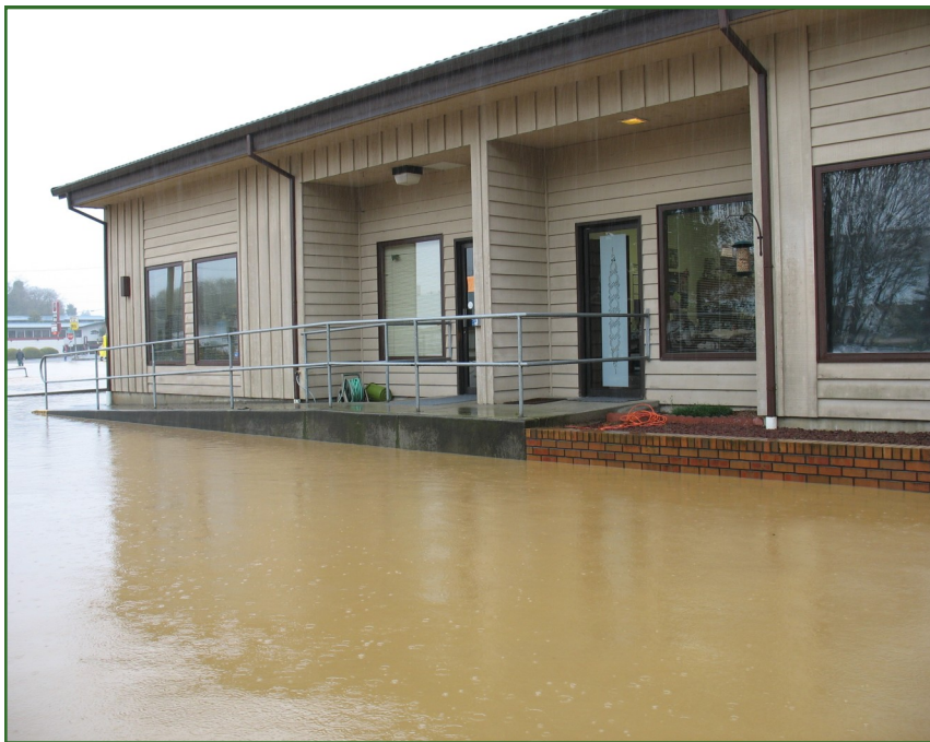
Water Level After Receding About 16 Inches

currently in the process of getting bids for its repair, which will be accomplished through FEMA Grant Funds.