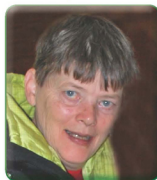
October 2015 Teresa Palmer